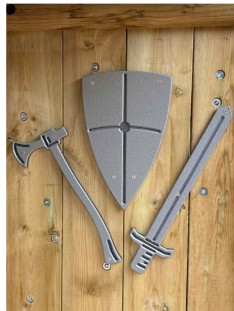
Under Deck Armoury