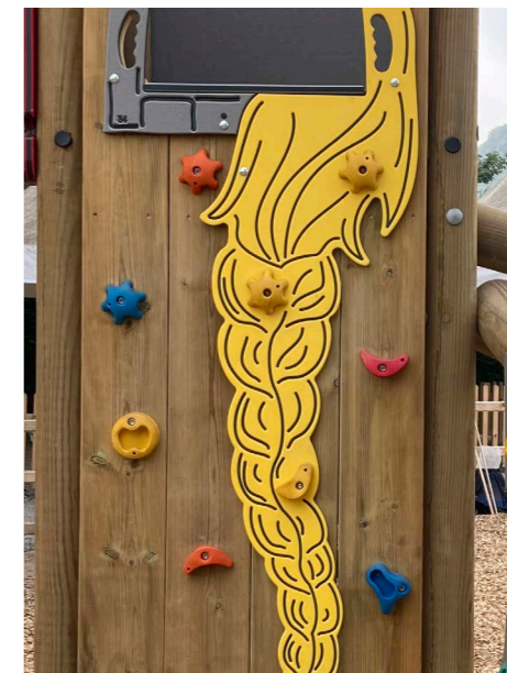
Rapunzel Climb Wall