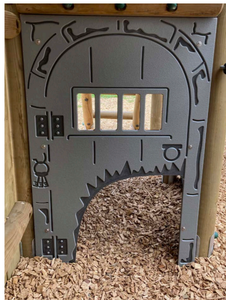
Under Deck Dungeon